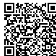
QR code for application of car decal

These safety and security measures will bring about some inconvenience to you and your child/children. However, we would like to seek your kind support and cooperation so that together we can make Punggol View Primary School a safe and secure second home for our children. Thank you.